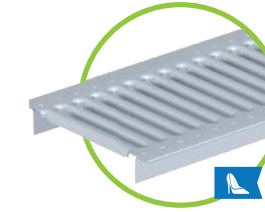
galvanized slotted heelproof grate SW 5/80, cl. A15 kN