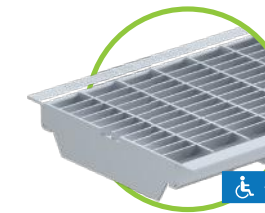
mesh grating NW 150 MW 30/10, class B, galvanized steel